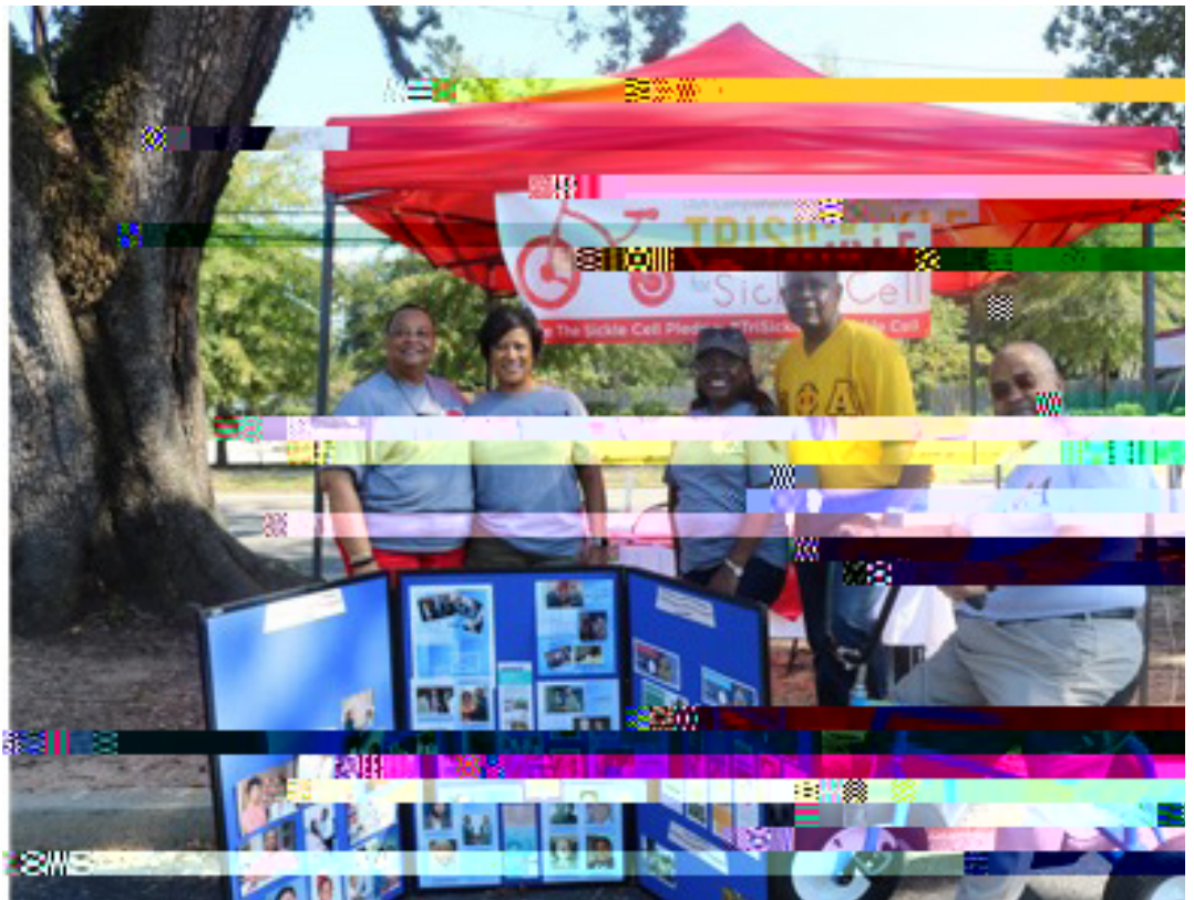
TRISICKLE for Sickle Cell Campaign

As a result of mandatory newborn screening, penicillin prophylaxis, and pneumococcal vaccines, the life expectancy of babies born with sickle cell disease (SCD) in the United States has improved to the 4th and 5th decades of life. While survival with SCD has improved, one-third of adolescents and young adults delay or do not successfully transition to adult care and are lost to medical follow-up for the management of their SCD and